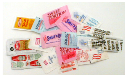
Single Service Condiments