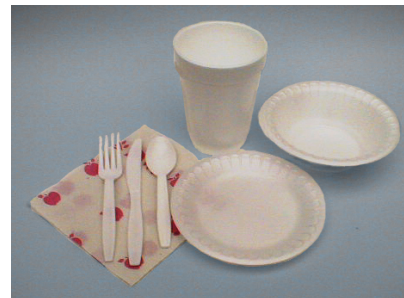
Single Service Food Service Items