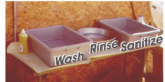
Dishwashing Station - Wash, Rinse, Sanitize & Air Dry