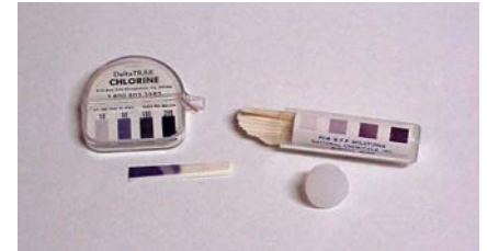
Chlorine Test Strips