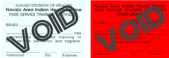
Current Food Handlers Card