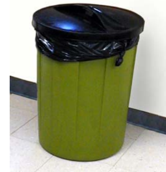
Covered Trash Can with Plastic Liner